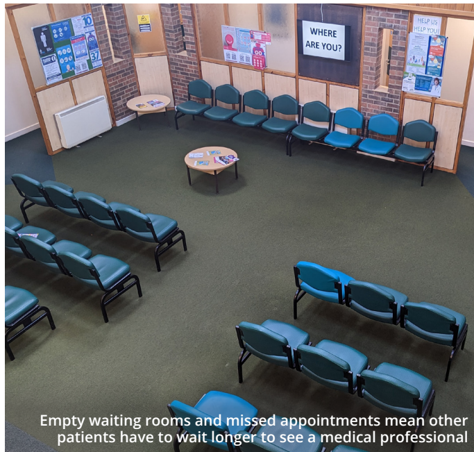
Empty waiting rooms and missed appointments mean other patients have to wait longer to see a medical professional