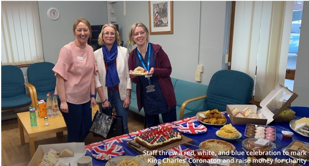
Staff threw a red, white, and blue celebration to mark King Charles' Coronation and raise money for charity

Patients visiting the Whinfield Medical Practice may be surprised to see staff dressed in some unusual attire; but it's all for a good cause!